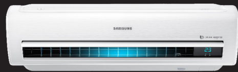
Nordic Smart Exclusive